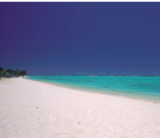
Top The gentle waters of the Indian Ocean surround Mauritius. Centre Abundant flora and fauna. Above Secluded beaches with powder soft sands and turquoise seas